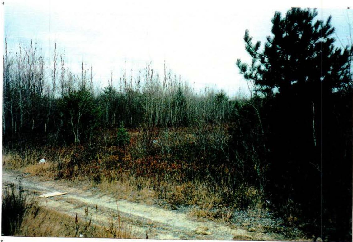
Picture 4. Lot 4 Con.3 Hanmer. The topsoil was stripped from this area 25 or more years ago. Aspen, birch, alders, jack and red pine have recolonized this site. Picture taken November 8, 1995