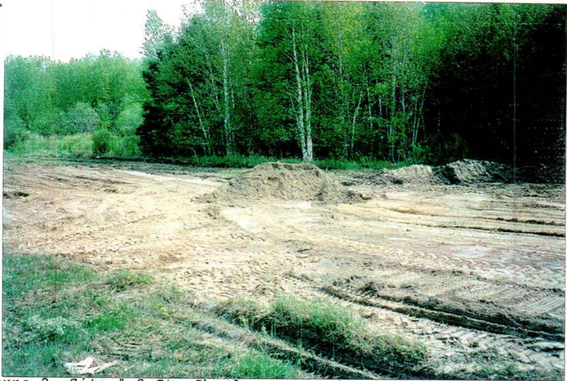
Picture 2. Site # 2 St. Charles area. The stripping of topsoil at this site has just begun.