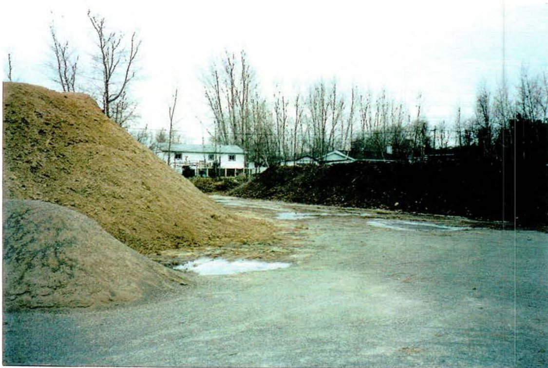
Picture 7. Hanmer. Yard showing the piles of different types of soil available for blending. Picture taken November 8, 1995.