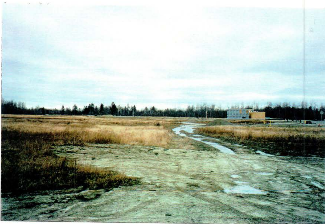
Picture 5. Hanmer Twp. Subdivision development showing stripped and piled topsoil. Picture taken November 8, 1995.

Pictures of these other types of topsoil stripping follow.