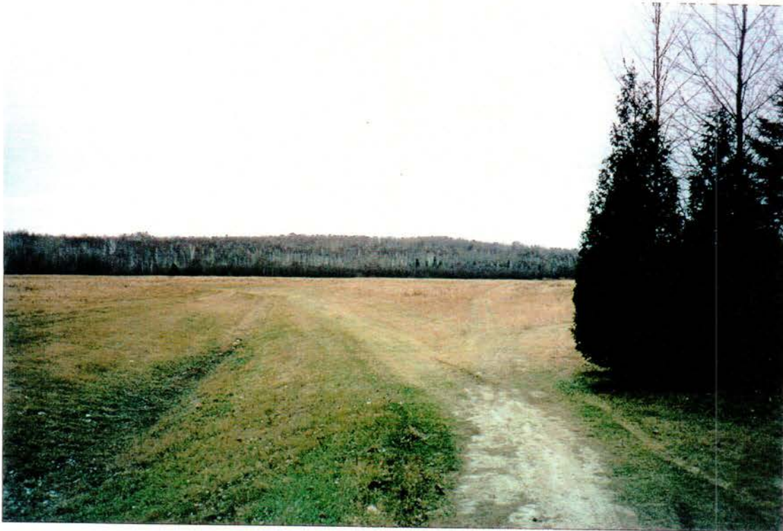
Picture 1. Lot 1 Con. 2 Hanmer. The area on the left side of the ditch has not had the topsoil removed. The area at the back right side of the picture was stripped in the last 5 years. Picture taken November 8, 1995.