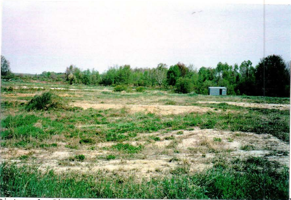
Picture 1. Site # 1 St. Charles area. Topsoil stripped during past 1 to 3 years. Picture taken June, 1996.