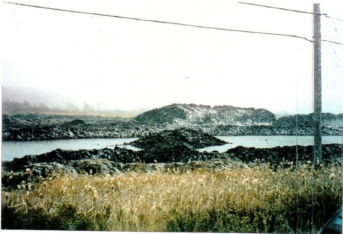
Picture 6. Capreol Township. View of Black muck stripping operation. Picture taken November 8, 1995