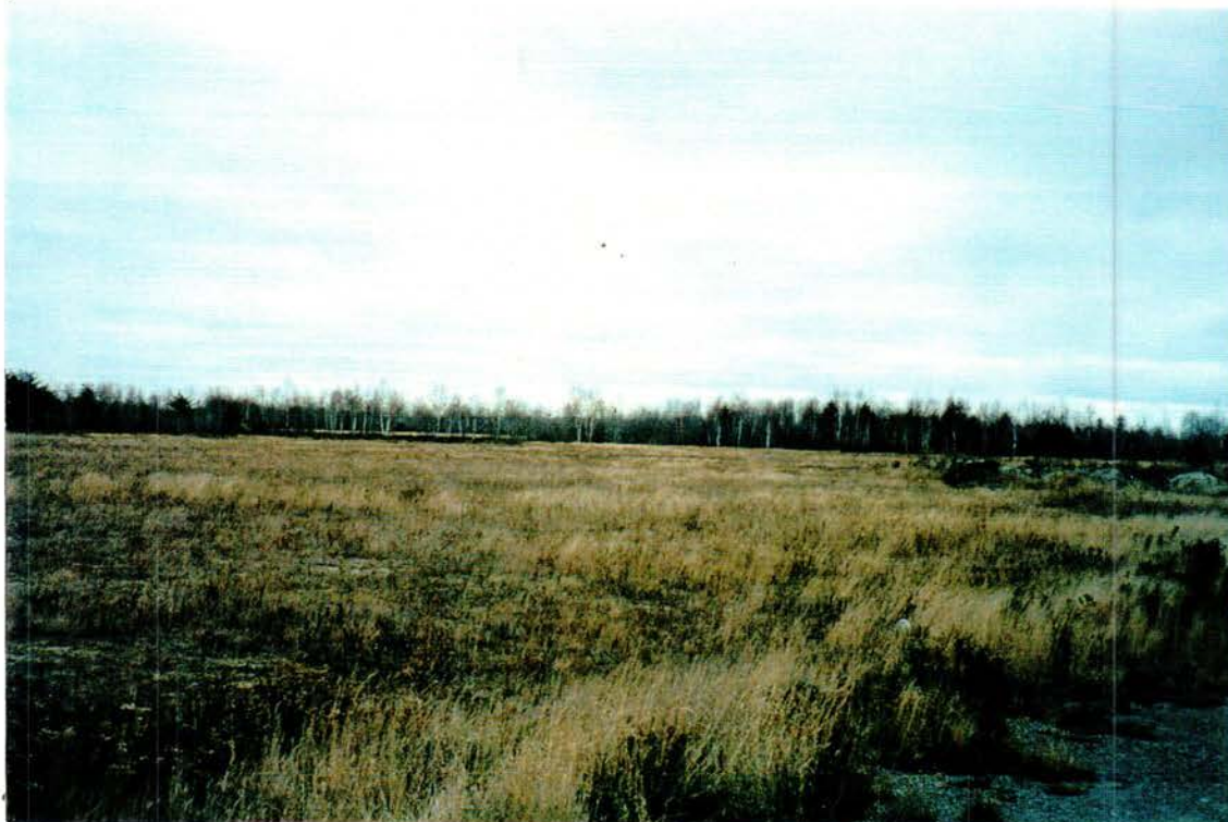
Picture 2. Lot 6 Con. 1 Hanmer. Topsoil was stripped about 5 years ago. There has been a thin regeneration of grass and weeds. Picture taken November 8, 1995.