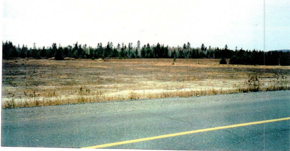
Picture 3. Lot 5 Con. 3 Hanmer. The topsoil was stripped about 10 years ago. There is a thin sparse cover of grass and weeds. A few rows of conifers have been planted. Picture taken Nov. 8, 1995.